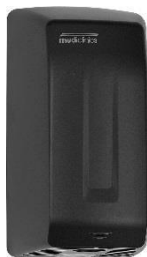
M04AB Matte black finish