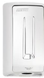
M04AC Bright finish