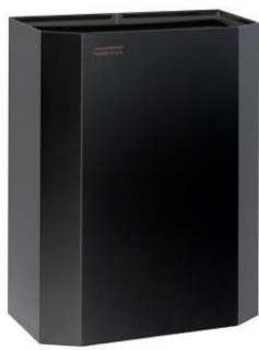
PPA2279B Black epoxy finish