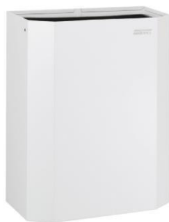
PPA2279 White epoxy finish