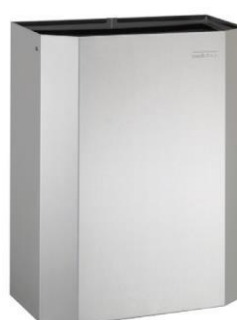
PPA2279C Bright finish