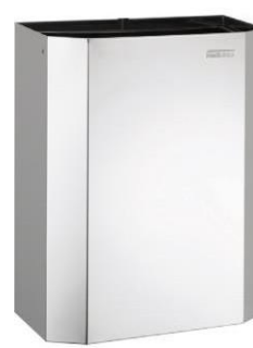
PPA2279CS Satin finish