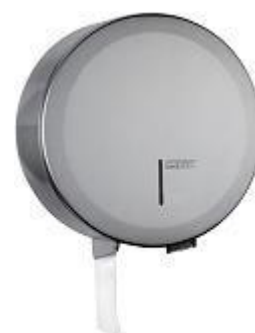
PR2783CS Satin finish