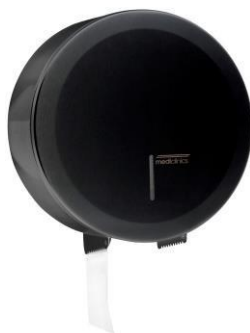
PR2783B Black epoxy finish