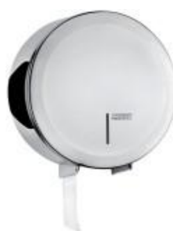
PR2783C Bright finish