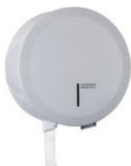
PR2783 White epoxy finish